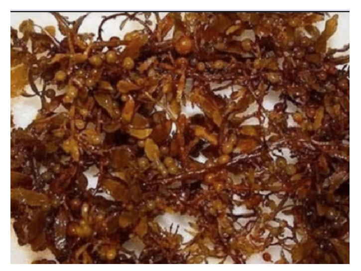
Fig. 12: Sargassum polycystum