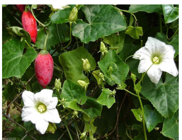
Fig. 5: Coccinia grandis

The leaves of Aegle marmelos , also known as Bilva in ancient Sanskrit, were employed as a herbal treatment in the Indian system of medicine.<sup>29</sup> Using important marker biochemical indicators, the hepatoprotective efficacy of Aegle marmelos in rats with alcohol-induced liver injury was assessed. The findings revealed that Bael leaves have a strong hepatoprotective effect. Other researchers came to similar conclusions.<sup>30</sup>