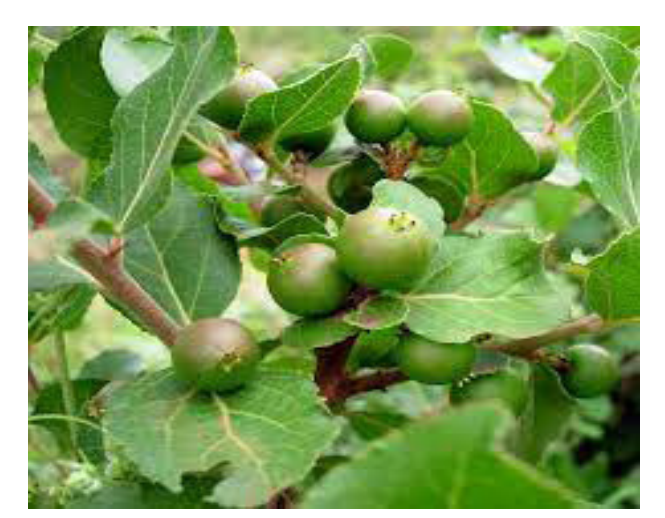
Fig. 1: Flacourtia indica

The methanol extract, on the other hand, had no discernible effect on paracetamol-induced liver necrosis. Petroleum ether and ethyl acetate extract's hepatoprotective properties could be achieved through the suppression of microsomal drug metabolising enzymes. However, the dose utilised in this study