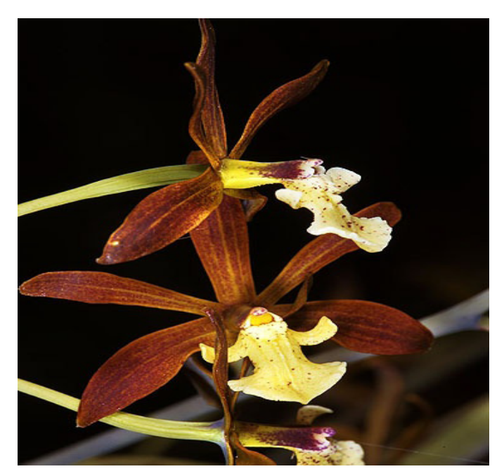
Fig. 14: Prostechea michuacana

These findings revealed that a methanolic extract of PM could protect against paracetamol-induced lipid peroxidation, hence avoiding the harmful effects of paracetamols toxic metabolites. This hepatoprotective effect was similar to that of sylmarin.