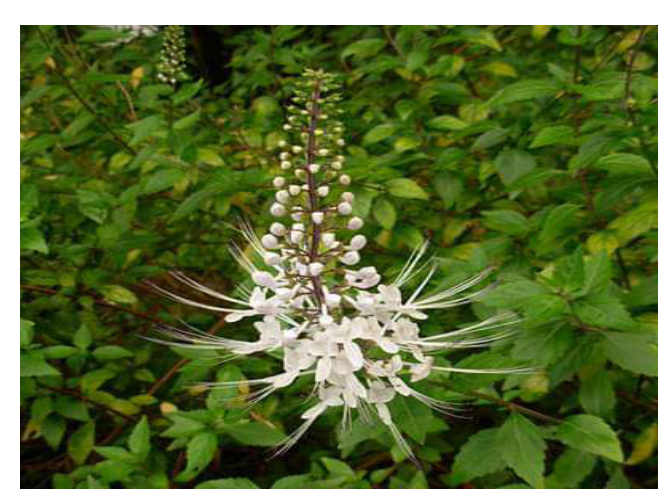
Fig. 9: Orthosiphon stamineus

The hepatoprotective effect of Orthosiphon stamineus methanol extract was tested in a paracetamol-induced hepatotoxicity rat model. Biochemical markers like AST, ALT, ALP, and lipid