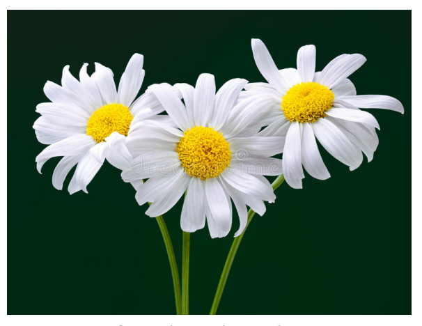
Fig. 4: Chamomile capitula

The effect of an ethanolic extract of Chamomile recutita capitula (400 mg kg-1, P.O.) on blood and liver glutathione, Na+ K+-ATPase activity, serum marker enzymes, serum bilirubin, glycogen, and thiobarbutiric acid reactive substances against paracetamol-induced liver damage in rats was investigated to determine the possible mechanism of hepatoprotection. The extract of Chamomile recutita was found to have reversal effects on the levels of the above-mentioned parameters in paracetamol hepatotoxicity, implying that it has hepato-protective and/or hepato-stimulant activity.<sup>24</sup>