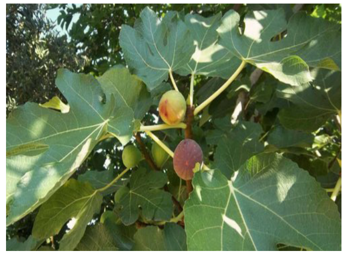
Fig. 10: Ficus carica

In CCl4-induced liver damage rats, a methanolic extract of Ficus carica Linn. (Moraceae) leaves was tested for hepatoprotective