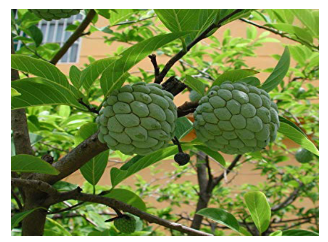
Fig. 2: Annona squamosa

The hepatoprotective efficacy of Annona squamosa extracts (300 and 350 mg/kg bw) in an isoniazid + rifampicin-induced hepatotoxic model in albino Wistar rats was investigated. When compared to the hepatotoxic group, the therapy group had a substantial decrease in total bilirubin, a significant rise in total protein, and a significant decrease in ALP, AST, and ALT.<sup>19</sup> The hepatotoxic group had hepatocytic necrosis and inflammation in the centrilobular region, as well as portal triaditis, according to the histological findings. The therapy group had low inflammation and mild portal triaditis, with normal lobular architecture. Another study looked at the protective effect in hepatotoxicity caused by diethylnitrosamine.<sup>20</sup> The extracts of Annona squa-mosa were found to have a hepatoprotective effect in this investigation, suggesting that the plant extract could be an efficient treatment for chemical-induced liver damage.21