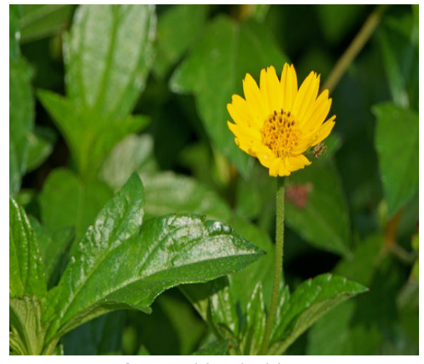
Fig. 6: Wedelia calendulacea

The hepatoprotective potential of an ethanolic extract of Wedelia calendulacea L. (Asteraceae) was investigated in rats after they were exposed to CCl4-induced acute hepatotoxicity.<sup>27</sup> The use of an ethanolic extract of Wedelia calen-dulacea resulted in a dose-dependent reduction in CCl4-induced higher serum enzyme activity, as well as an increase in total proteins and bilirubin, indicating that the extract could aid in the recovery of normal liver function in rats. In CCl4-induced hepatic damage rats that received an ethanolic extract of Wedelia calendula-cea, the weight of organs such as the liver, heart, lung, spleen, and kidney increased compared to the CCl4-treated control group.<sup>28</sup>