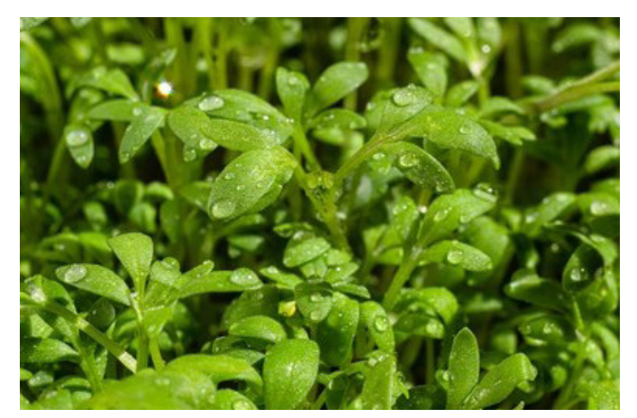
Fig. 11: Lepidium sativum

In CCl4-induced liver injury in rats, the hepatoprotective activity of methanolic extract of Lepidium sativum at doses of 200 and 400 mg/kg was examined. All biochemical parameters were observed to be significantly reduced in groups treated with Lepidium sativum. In the Lepidium sativum-treated groups, the severe fatty alterations in the livers of rats produced by CCl4 were minimal.<sup>34</sup>