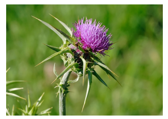
Fig. 3: Silybum marianum

Polyphenolic extracts of Silybum marianum and Cichorium intybus were tested for their ability to protect rats from thioacetamide-induced hepatotoxicity.<sup>22</sup> The extracts were given to the rats at a dose of 25 mg kg-1 body weight, along with 50 mg kg body weight thioacetamide. In the groups treated with extracts and thioacetamide, activity