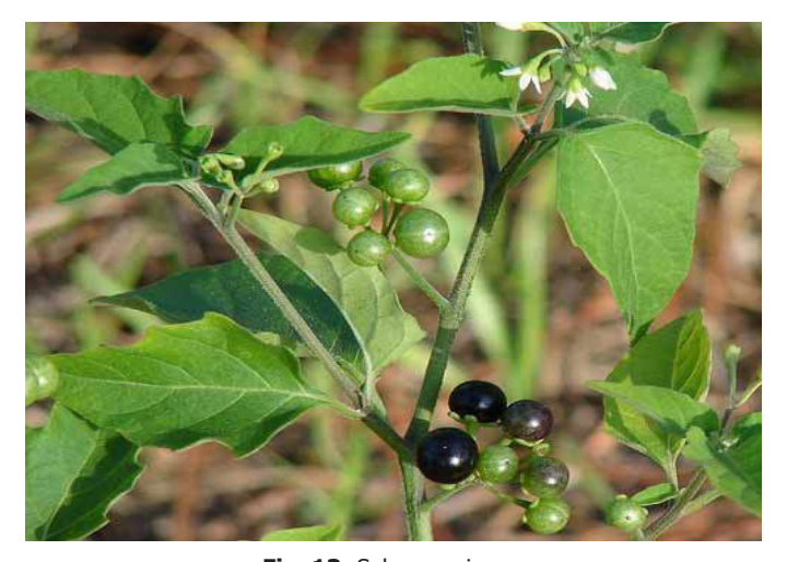
Fig. 13: Solanum nigrum Journal of Complementary Medicine Research | Volume 13 | Issue 4 | 2022

The preventive effects of aqueous ex-tract of SN (ASNE) against liver damage in CCl4-induced chronic hepatotoxicity in rats were investigated in another investigation. The results demonstrated that ASNE treatment reduced CCl4-induced blood levels of hepatic enzyme indicators, superoxide, and hydroxyl radicals considerably. ASNE reduced the occurrence of liver diseases such as hepatic cells hazy swelling, lymphocyte infiltration, hepatic necrosis, and fibrous connective tissue proliferation generated by CCl4 in rats, according to histopathology. As a result, the findings of this study suggest that ASNE may protect the liver from CCl4-induced oxidative damage in