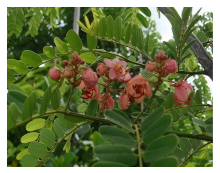
Fig. 8: Cassia roxburghii

Cassia roxburghii DC seeds have been utilised in ethnomedicine for a variety of liver ailments because to their hepatoprotective properties. In rats, a methanolic extract of Cassia roxburghii restored the toxicity caused by the combination of ethanol and CCl4 in a dose-dependent manner. At doses of 250 mg/kg and 500 mg/kg, the extract has a similar impact to Liv-52®, a well-known plants-based hepato-protective formulation against hepatotoxins.<sup>31</sup>