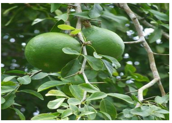
Fig. 7: Aegle marmelos

Journal of Complementary Medicine Research | Volume 13 | Issue 4 | 2022