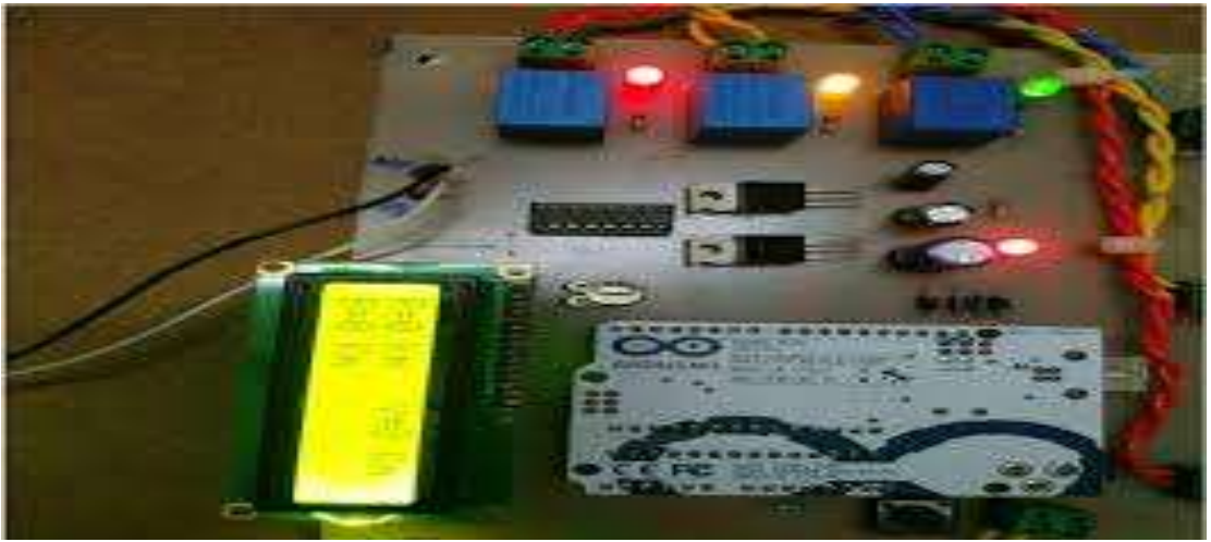
Figure 5: The figure 5 shows the location of the fault in the LCD display