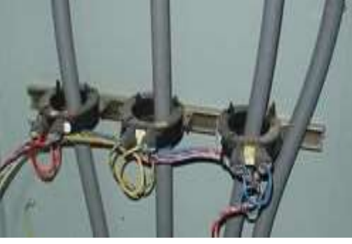
Figure 5 : Current transformer

The current transformer used in this project is used to determine if the current flowing through out the kit is either low current or high current. After determining the current the current transformer will then send it to shunt resistor. From the shunt resistor it is then sent to precision rectifier.