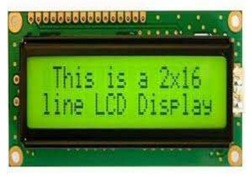
Figure 3 : LCD Display

LCD includes two glass boards, with the fluid gem material in the middle of them. The inward surface of the glass plates are covered with anodes. This LCD display is used to display the fault locations occurred in the underground cable system. Using an LCD display the user can easily know where the defect is located and can repair it easily.