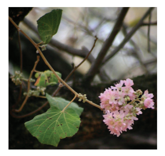
Figure 1. Dombeya rotundifolia: a branch showing leaves and flowers.

[9,10]. The flowers and bark of Dombeya torrida (J. F. Gmel.) Bamps are used as an herbal medicine for indigestion, while the roots are used for the treatment of chest pains and colds in East Africa [11]. In Tanzania, the root decoction of D. kirkii Mast. is used in the treatment of yaws and abdominal pains [12]. Pharmacological evaluations of D. burgessiae extracts revealed that the species possesses antioxidant and antidiabetic properties [10], while D. torrida extracts exhibited antibacterial and antifungal activities [11], and D. acutangula Cav. var. acutangula, D. ficulnea Baill., D. pilosa Cordem., D. populnea (Cav.) Baill., and D. reclinata Cordem. exhibited free radical scavenging and antioxidant activities [13]. The ethanol and dichloromethane extracts of D. burgessiae and D. cymosa Harv. showed cyclooxygenase-1 (COX-1) inhibition and antibacterial activities [14]. Dombeya rotundifolia is receiving increasing research attention as an herbal medicine in tropical Africa [15-21]. Due to its high demand as traditional medicine, the bark of D. rotundifolia is sold as an herbal medicine in informal herbal medicine markets in Gauteng province in South Africa [22,23]. The aim of this study was to review the medicinal uses, phytochemical and pharmacological properties of D. rotundifolia .