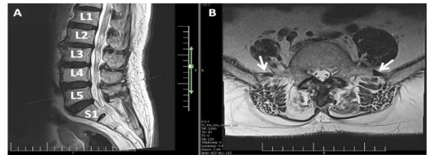
Figure 1: Sagittal T2W total spin MRI image shows normal numbering of spinal column without LSTV

image of the entire spine were also provided Then all MRI exams were evaluated by two radiologists with 8 and 10 year experience. The inter-observer coefficient agreement between the two radiologists were determined ( r=0.98 ; P= 0.0001 ). Vertebral bodies were counted from C2 to S1 (Fig 1) To perform the statistical analysis, data were allocated to each of the upper and lower parts of the vertebral bodies and intervertebral discs by dividing the T12-L1 vertebral disc (No. 1) and the lower half of L5 vertebra (No. 15). After collecting data on vertebral surfaces associated with ILL, the data were entered into SPSS statistical software and then analyzed.